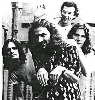
Daddy Cool: Comes back again.

It was after their performance that Queen was booed by sections of the big crowd, prompting Mercury to proclaim he would return to Australia only when "we are the biggest band in the world".